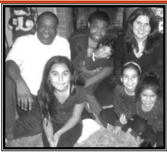
Butler Family Christmas 2011 –PA