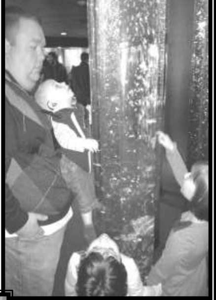
The Lills, PA, visit the Baltimore Aquarium