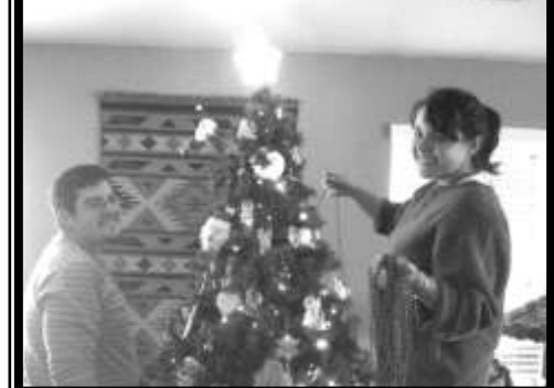
Wilkinson Family, NM, decorating the tree